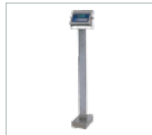
Indicator Connector Column