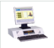
LL2-WT-L Weighing Terminal