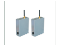
RF Communication Kit

Tunaylar keeps its right secret to change all technical specifications, image, colour and accessories of the products without prior notice.